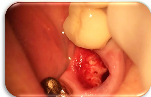
Fig. 3: Delivery and Initial Plug Compression

Using the #6 carbide bur included in the UCD kit remove the Lamina Dura and make lingual or palatal holes in the lower half of the socket where trabecular bone is available to procure medullary blood containing osteoclast cells (220µm) and osteoblasts to trigger the Regional Acceleratory Phenomenon (RAP). 4 Profuse bleeding will be absorbed by the hydrophilic OsteoGen® Plug and will help prevent dry socket. Do not hydrate the Plug prior to delivery. 5,6