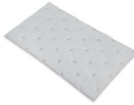
EverClean™ Oil Sheets (10/Pk) 5028209U0