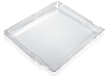
EverClean™ Door Shield (3/Pk) 5028220U0