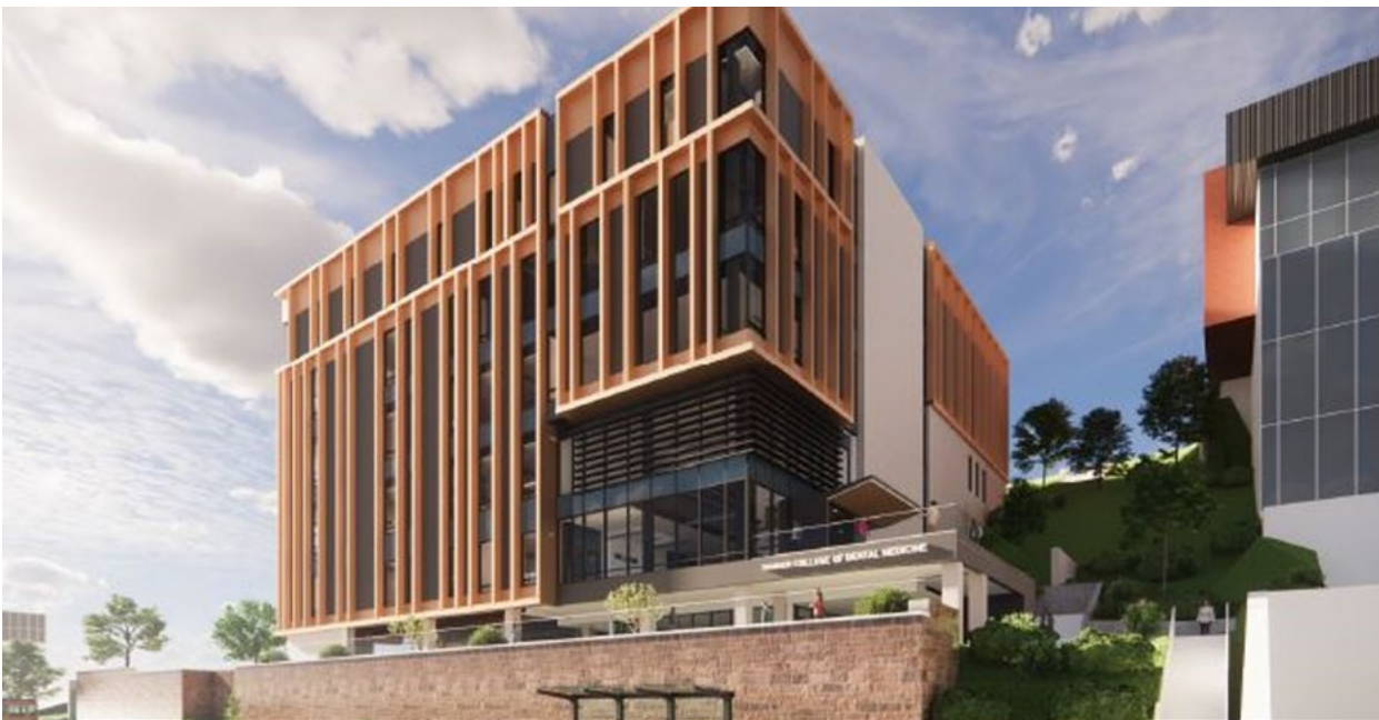
Tanner College of Dental Medicine (View from Hambley Boulevard)