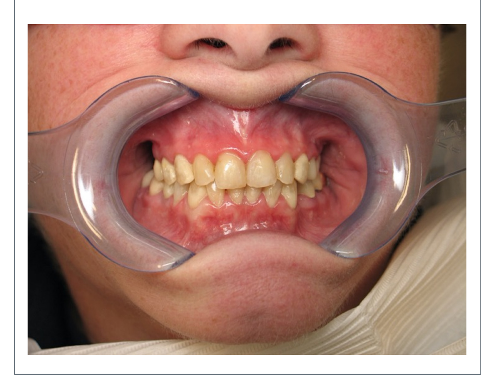
Figure 8 – Clinical presentation of the patient's dentition after restorative treatment with resin modified glass ionomer and conventional glass ionomer.

begin using a mouthwash (Moisyn) that would alleviate her constant xerostomia. A compounding pharmacy was contacted to create pilocarpine lollipops (5 mg pilocarpine in a 2g sorbitol/xylitol base), which the patient was instructed to use as needed throughout the day. At her second visit, she remarked that the mouthwash seemed to be helping because she had noticed a decrease in oral discomfort. Nonsurgical periodontal therapy was provided along with a second application of silver diamine fluoride to all surfaces. She was referred to an endodontist for evaluation and treatment of her symptomatic teeth and she consented to an initial treatment plan consisting of the elimination of all active caries disease and restoration of all surfaces with conventional and resin modified glass ionomer.